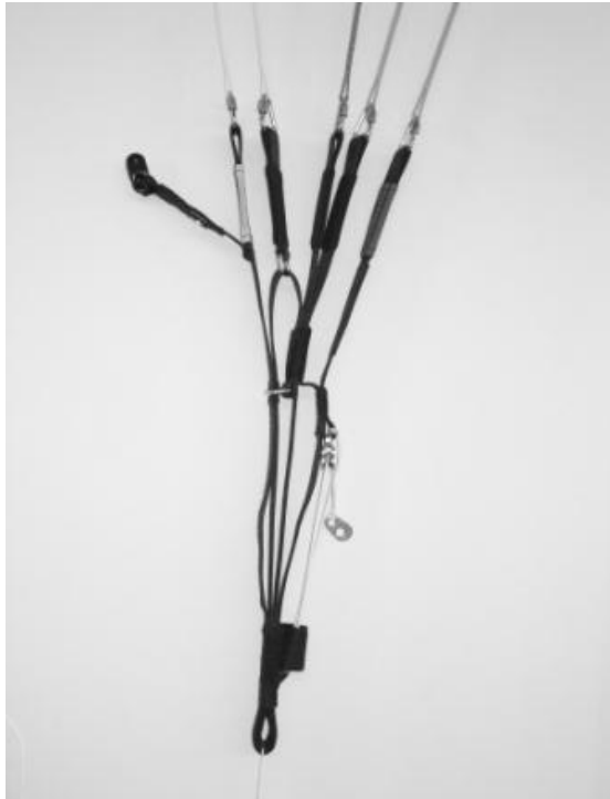
Riser not accelerated